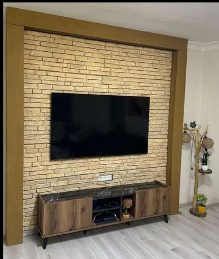
SPLIT STONE PANEL 42 x 120 cm | 40 mm

Deep textured, 3D stone surface creating dramatic light and shadow effects. Premium architectural finish suitable for both interior and exterior applications with UV resistant coating.